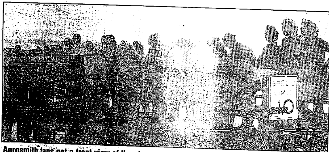
Aerosmith fans get a front view of the stage set up in the parking lot overlooking the bay.